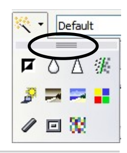
Table 3: Graphic filters and their effects

Click the Filter icon to display the Graphic Filter toolbar, which provides options for applying basic photographic and effect filters to images from within Calc. To "tear off" this toolbar and place it anywhere on the screen, click on the three parallel lines and drag it away.