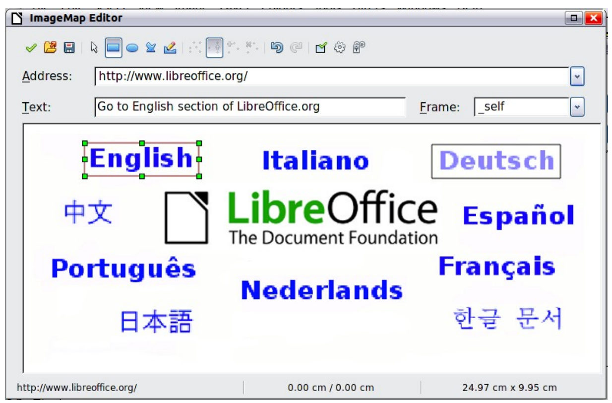
Figure 12: The dialog to create or edit an image map

The main part of the dialog shows the image on which the hotspots are defined. A hotspot is identified by a line indicating its shape.