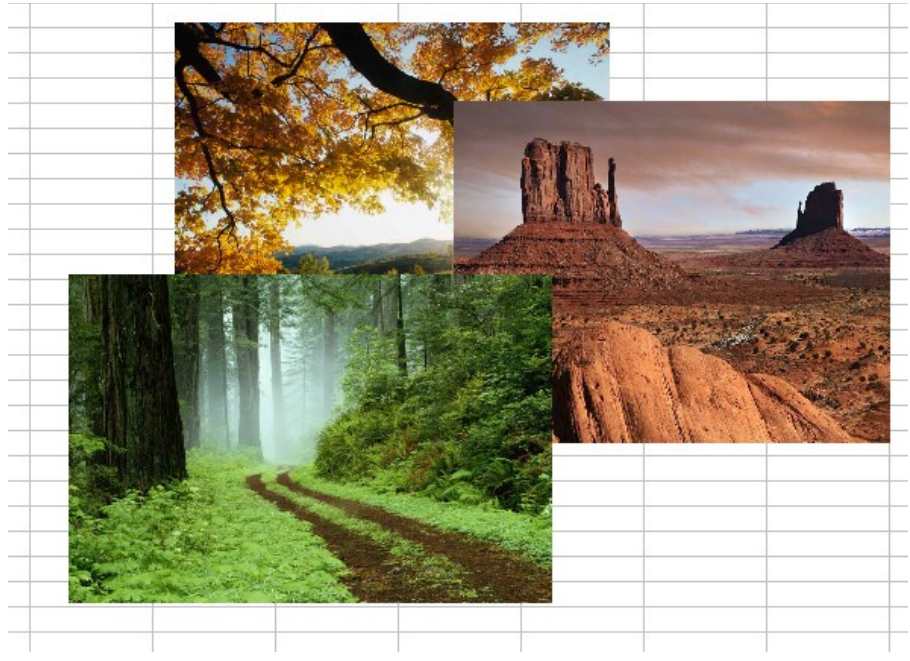
Figure 9: Layering effect

Graphics in a Calc document are maintained in a similar manner to a deck of cards. As you add more images to the document, each image occupies a new layer at the top of the stack. To arrange graphics, you tell Calc to change the order of layers in the stack.