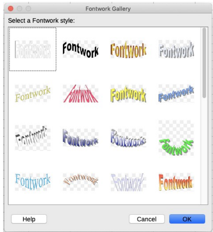
Figure 11: The Fontwork Gallery

3) Double-click the object to edit the Fontwork text (see Figure 12). Select the text and type your own text in place of the black Fontwork text that appears over the object.