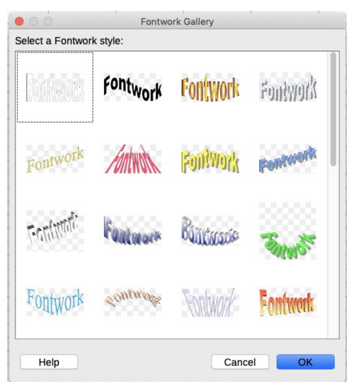
Figure 12: The Fontwork Gallery