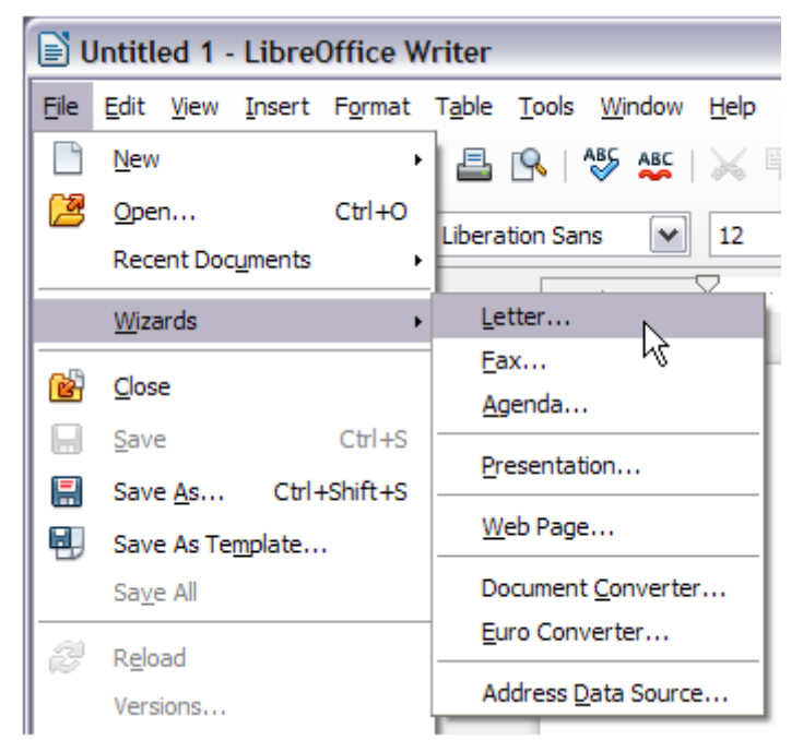
Figure 3: Creating a template using a wizard

1) From the menu bar, choose File > Wizards > [type of template required].