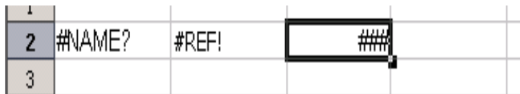
Figure 1: Error codes displayed within cells

As an example, Figure 1 shows the error code returned when a column is too narrow to display the entire formatted date. The date displayed within the input line, 04/05/1998, would fit within the cell without a problem, but the format used by the cell produces the date value Sunday, April 05, 1998 .