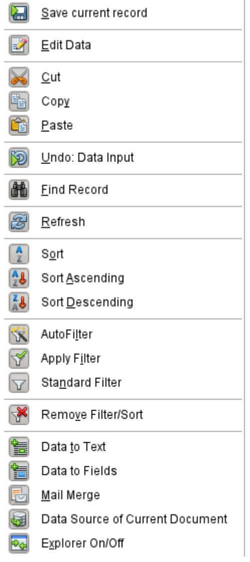
Figure 1: Data source browser toolbar