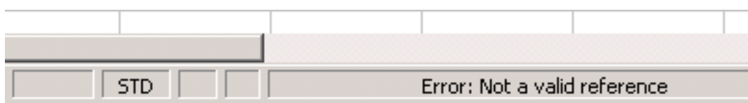
Figure 2: An error message displayed in the Status bar

When the cell displaying the #REF! error code in Figure 1 is selected, the Status bar displays the error message as shown in Figure 2. This message is more descriptive than the message displayed in the cell, but it still may not provide enough information to correctly diagnose the problem. For fuller explanations, consult the following tables and the Help topic, Error Codes in LibreOffice Calc .